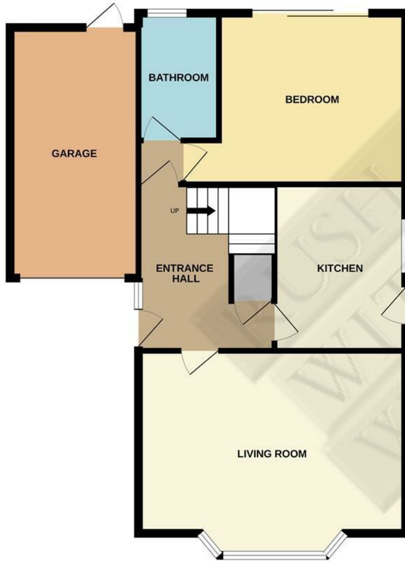
1ST FLOOR 610 sq.ft. (56.7 sq.m.) approx.